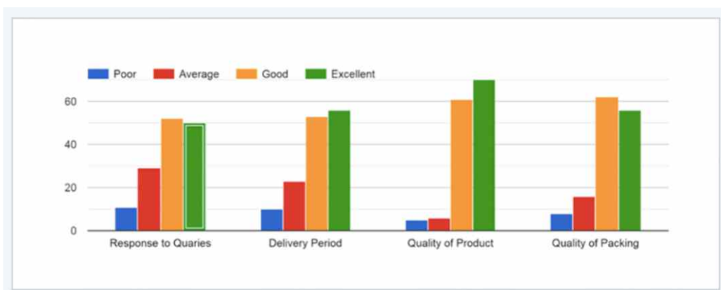
Survey From Our Customers